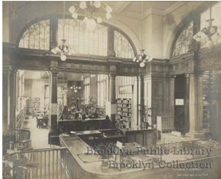
This is the Park Slope branch library mezzanine reading space for children. Note the fully restored original Tiffany stained glass sky light window.